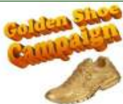
Golden Shoe Campaign A walking program which designated routes in Grand Haven, Holland, and Zeeland. Maps, prizes and education were included. Funding by local businesses and the Community Foundation of the Holland/ Zeeland Area. $25,000