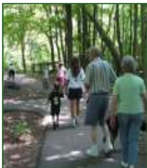
Coopersville Community Trail, Brochure & Evaluation Funding by MDCH/FSNE $8,000 grant