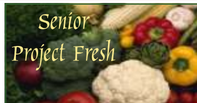
Senior Project Fresh provides low-income seniors with coupons that can be exchanged for eligible foods at farmers' markets, roadside stands, and community supported agriculture programs. Funding by MDCH/FSNE $14,700 grant

The Ottawa County Wellness Coalition seeks to increase access/education regarding Healthy Eating through Farmer's Market initiatives, educational information on trail brochures, and at kick-off events.