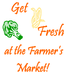
Get Fresh at the Farmer' Market Funded by The US Department of Health and Human Services, Office of Disease Prevention and Health Promotion. $3775