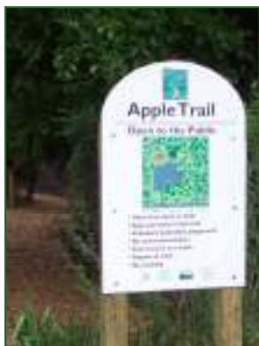
Apple Trail, Park, Brochure & Evaluation Funding by Michigan Department of Community Health (MDCH) and Food Stamp Nutrition Education (FSNE) $14,000

The Ottawa County Wellness Coalition seeks to increase access to Physical Activity through the addition of walking trails, sidewalks, bike paths and recreational facilities.